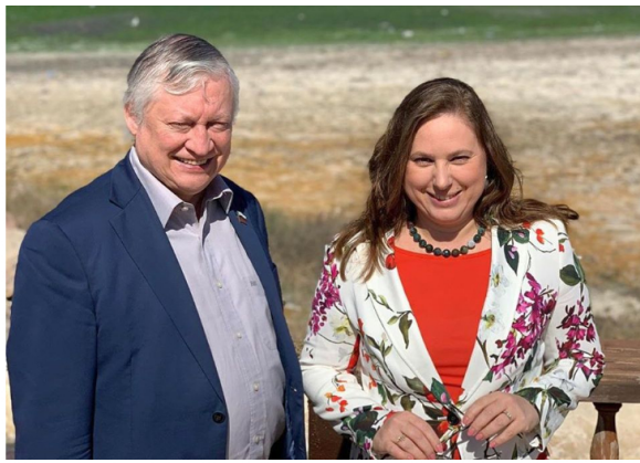
Karpov and Judit Polgar soaking the light and sun of Djerba

The two distinguished chess personalities contributed to another worthy cause while in Djerba: They opened the first school chess club on the island named after the 12th World Champion.