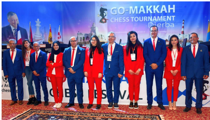
Arbiters and assistants

This passionately organized tournament paid attention to every detail and was marked by a professional, aesthetic touch: arbiters and assistants clad in matching uniforms.