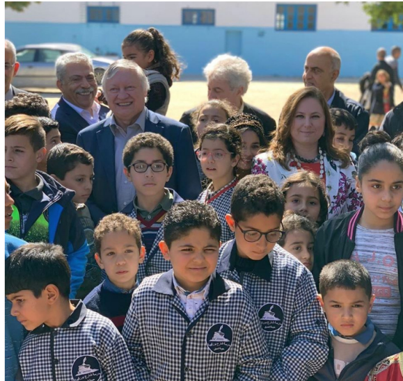
Karpov and Judit Polgar surrounded by enthusiastic school kids on the occasion of the opening of the school chess club on Djerba

The two distinguished chess personalities contributed to another worthy cause while in Djerba: They opened the first school chess club on the island named after the 12th World Champion.