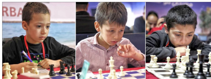
Tunisian young hopes greatly benefit from the opportunity to play at such a class international tournament on their doorstep