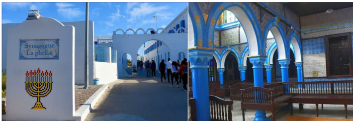
The synagogue La Ghriba ('Wonderworking') supposed to be the oldest synagogue in the world dating from the time of the second temple in Jerusalem