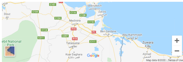
The largest island of North Africa, located in the Gulf of Gabès, off the coast of Tunisia