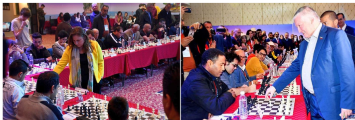
Karpov and Polgar at their simultaneous exhibitions

Four main tournaments were played: A Master tournament and three Opens: Open A (>2000), Open B (1500–2000) and Open C (<1500), a blitz tournament and several side events including two simultaneous exhibitions by two leading chess personalities, Anatoly Karpov and Judit Polgar.