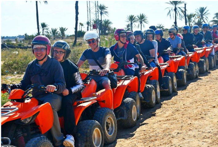
An original way to explore the beautiful island

A full day was dedicated to a sight-seeing. Museums, a crocodile farm, a synagogue and other beauty spots were visited for which participants were provided with buggies.