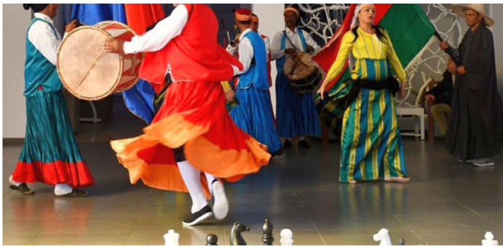
The guests were entertained throughout the tournament by performers presenting typical folklore of the island